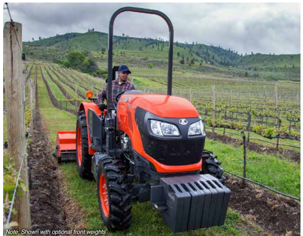
Note: Shown with optional front weights